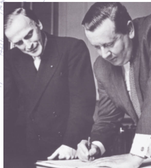
With violinist Yehudi Menuhin after the Bath Festival premiere of Arnold's Concerto for Two Violins and String Orchestra (1962)

Recognition and awards followed: in 1986 the Ivor Novello Award for Outstanding Services to British Music, in 1989 a Doctorate of Music from Miami University, Oxford Ohio, and a Knighthood in 1993. In October 2001 Sir Malcolm was awarded a Fellowship of the British Academy of Songwriters and Composers on the occasion of a special 80th birthday concert at the Wigmore Hall.