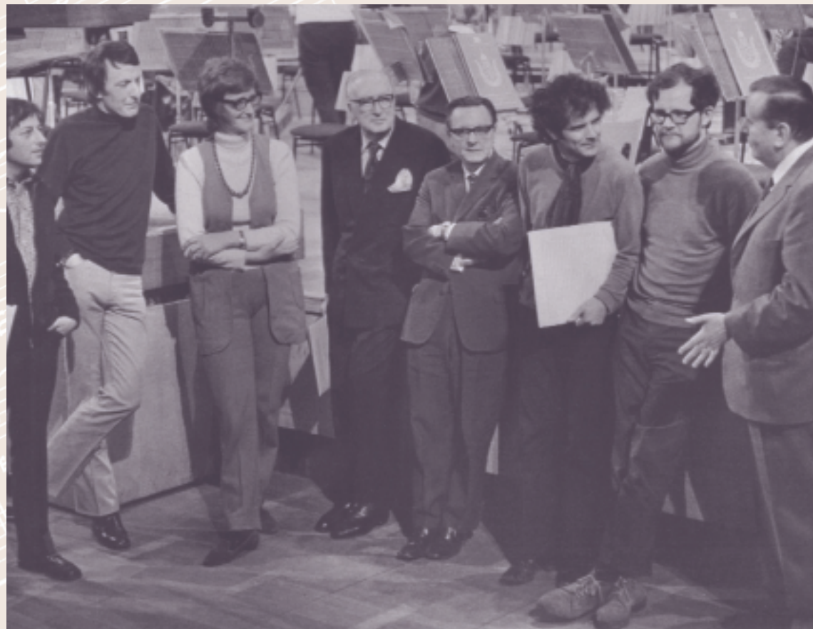
With composer colleagues at rehearsals for William Walton's 70 th birthday concert in London's Royal Festival Hall (1972). From left to right: André Previn; Richard Rodney Bennett, Thea Musgrave, William Walton, Robert Simpson, Peter Maxwell Davies, Nicholas Maw and Malcolm Arnold

gtr : guitar bgtr : bass guitar All other instrument names are given in full