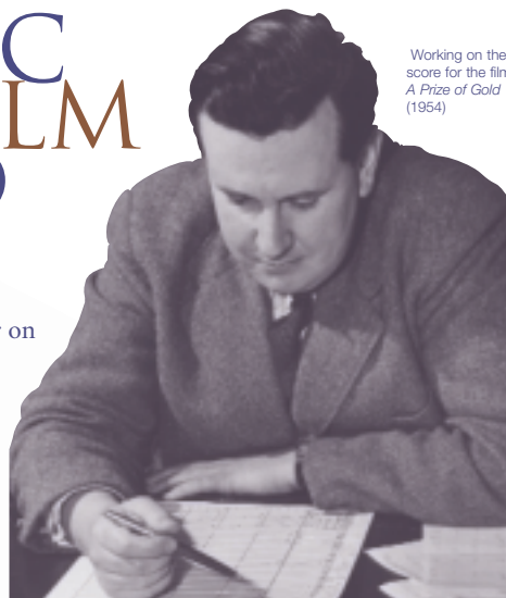
Working on the score for the film, A Prize of Gold (1954)

Then, at the other extreme, stands the Seventh Symphony – a work that baffled, even angered, critics at its first performance in 1974. This is violent, bleak, bitter music. The first movement is an immense dance of death, which far from progressing, developing – as symphonic first movements are supposed to do – circles obsessively, combining and re-combining fragments of motifs, as though the creative mind were unable to shake off